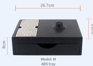
Model: M ABS tray